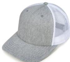
Grey Heather / White