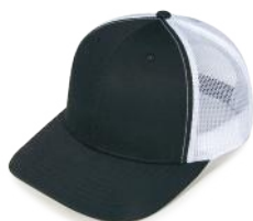
Black / White