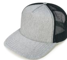
Grey Heather / Black