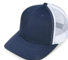
Navy / White