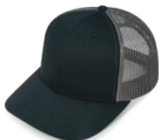
Black / Charcoal