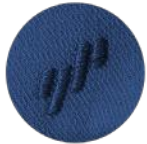
Y PLOGO ON RIGHT PROFILE

Reimagined baseball cap with enhanced Cool & Dry and ActiveGuard™ Technology for superior comfort. Added seam-sealed taping and Tri-Layer technique for a refined and smooth front finish. 6-panel structured cap with matching undervisor. Flexfit® fitted cap for modern comfort and refined styles. 8-rows of stitching on visor. Embroidered with the 4BAR logo to assure the quality of our renowned craftsmanship.