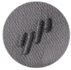
YP LOGO ON RIGHT PROFILE

The FLEXFIT NU® Adjustable Cap combines the original Flexfit® Tech, enhanced Cool & Dry technology, and ActiveGuard™ technology to embody refinement and modern comfortability with an iconic foundation. Integrating personalized fit with an adjustable back that fits up to ten sizes, the FLEXFIT NU® Adjustable Cap is reimagined as an all-around player for the new premium everyday headwear. 6-panel structured cap with matching undervisor. Matching plastic snapback closure and 8-rows of stitching on visor. Embroidered with the 4BAR logo to assure the quality of our renowned craftsmanship. Reimagined Adjustable + Flexfit® Technology.