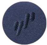
Y-PLUG ON RIGHT PROFILE

Patented Design. Pair the FLEXFIT® UNIPANEL™ Cap with just about any decoration. The fused front panel provides an uninterrupted canvas that allows for endless possibilities. UniPanel™ structured cap with silver undervisor, 8 rows of stitching on visor. Embroidered with the 4BAR logo to assure the quality of our renowned craftsmanship. FLEXFIT THE ONE AND ONLY ORIGINAL®.