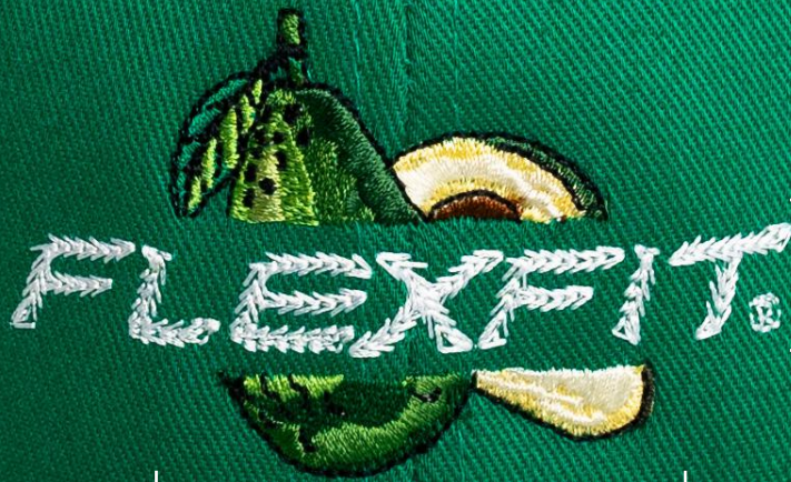
Logo: Flat Chain Embroidery