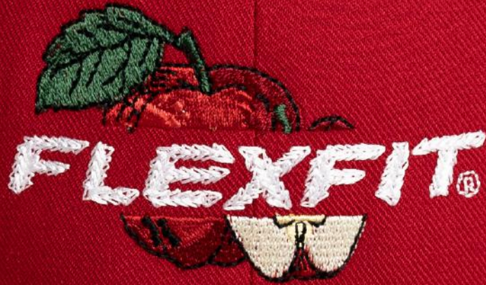
Logo: Flat Chain Embroidery