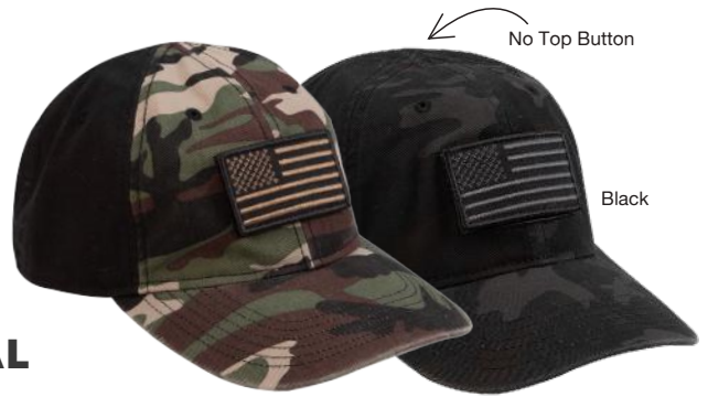
No Top Button