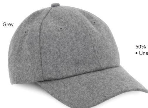
3360 STERLING $24.99

100% cotton, canvas exterior • 100% polyester, fleece lining • Polyfill insulation for added warmth • NO Sweat moisture-wicking sweatband • Convertible ear/neck flap • Imported