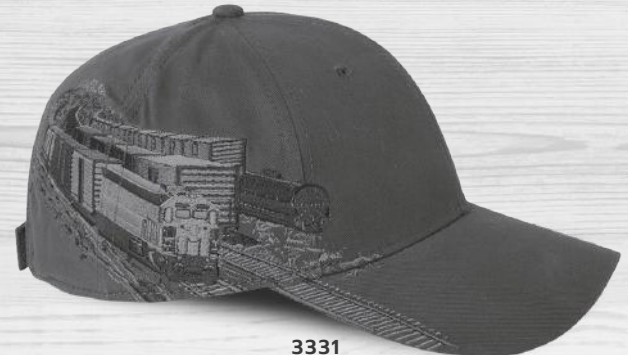
3331 RAILYARD Charcoal / $24.99