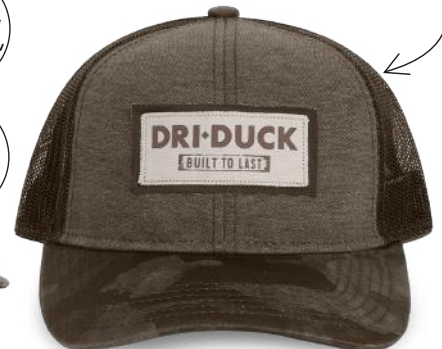
3011 Ridgeline Camo Trucker $24.99