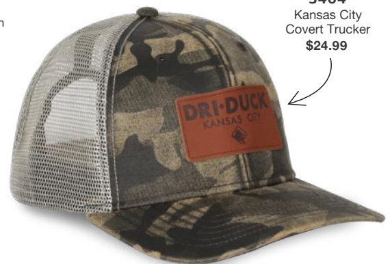
3464 Kansas City Covert Trucker $24.99