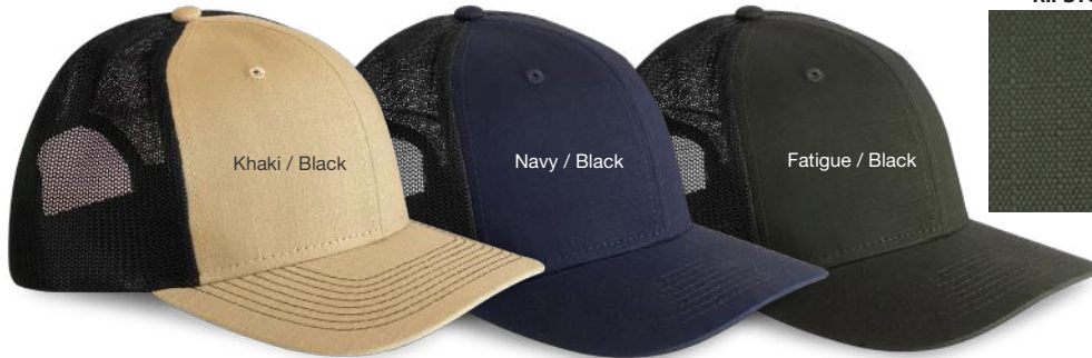
Khaki / Black

100% cotton, washed chino twill crown and bill • Unstructured, low-profile • Pre curved bill • NO Sweat moisture-wicking sweatband • Hook and loop closure • Headset-friendly with no top button • Embroidered removable flag patch • Imported