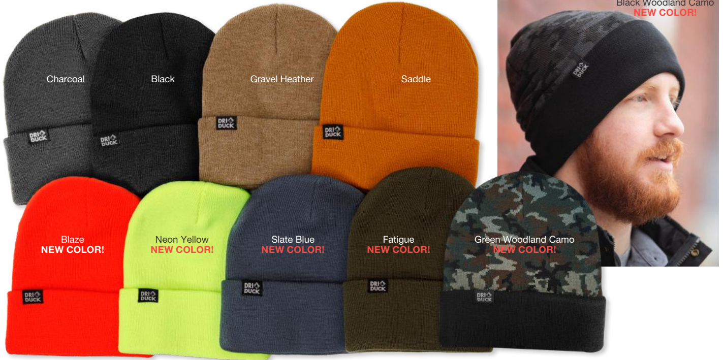
3523 COLEMAN $19.99

100% acrylic, rib knit • 3" fold-up cuff with DRI Duck woven wrap-label • Imported