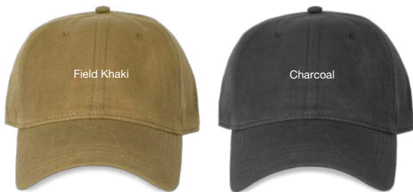
Field Khaki Charcoal