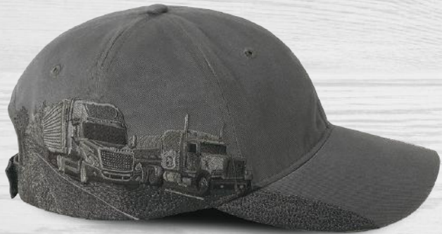
3350 TRUCKING Grey / $24.99