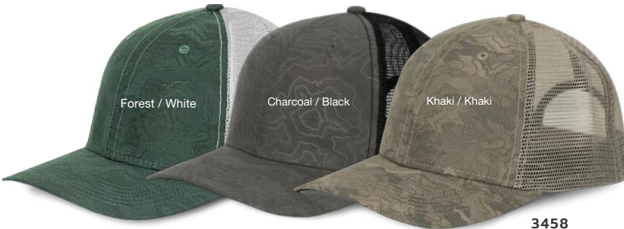
Forest / White

100% cotton, ripstop front panels and bill • 97% polyester/ 3% elastane, stretch mesh back • Structured, pro-shape • Slightly curved bill • NO Sweat moisture-wicking sweatband • Snapback closure • Imported