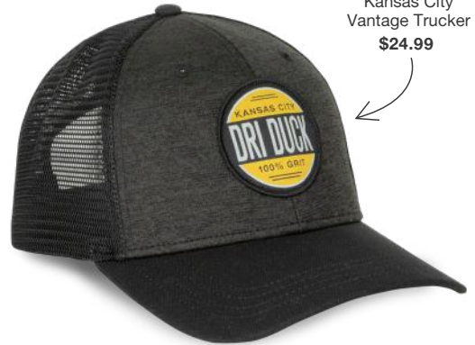
3462 Kansas City Vantage Trucker $24.99