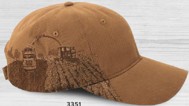
3351 HARVESTING Saddle / $24.99