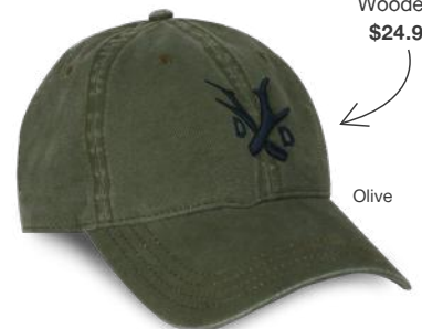
3204 Antler Woodend $24.99