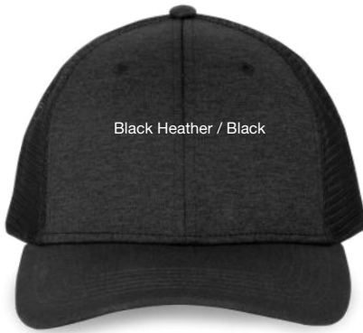
Black Heather / Black