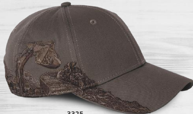
3325 EXCAVATING Dark Brown / $24.99