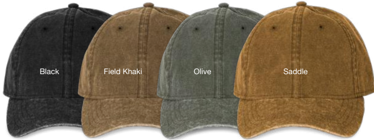
Black Field Khaki Olive Saddle