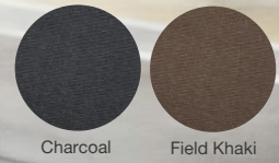
Charcoal Field Khaki