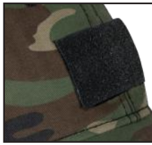
HOOK AND LOOP OPEN FOR DECORATION