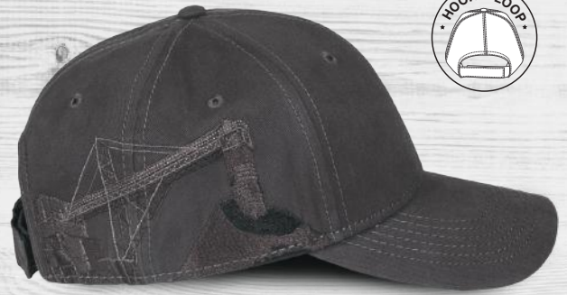
3349 MINING Charcoal / $24.99