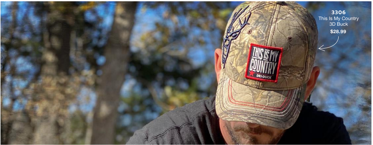
3306 This Is My Country 3D Buck $28.99