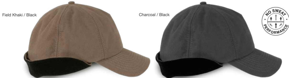
3753 CANVAS EARFLAP CAP $27.99

100% acrylic, rib knit • 3" fold-up cuff with DRI Duck woven wrap-label • Imported