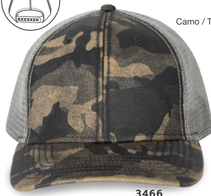
Camo / Tan