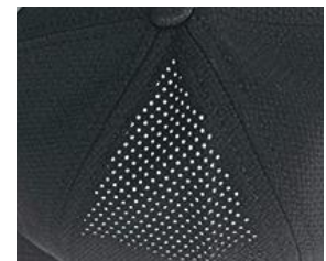
PERFORATED SIDE PANELS