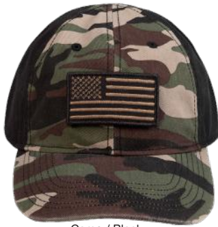
Camo / Black