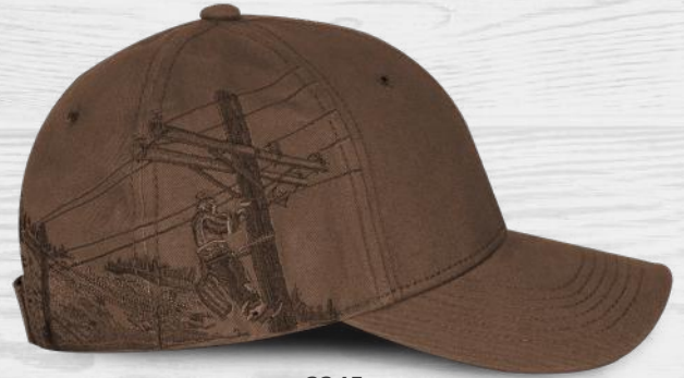
3345 LINEMAN Field Khaki / $24.99