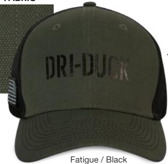
Fatigue / Black