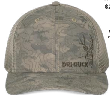
3461 Buck Head Territory $24.99