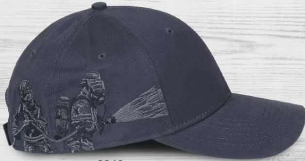
3348 FIREFIGHTER Navy / $24.99