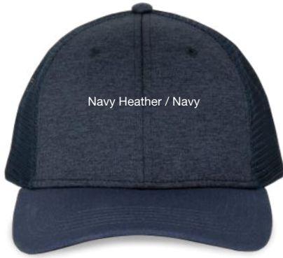
Navy Heather / Navy