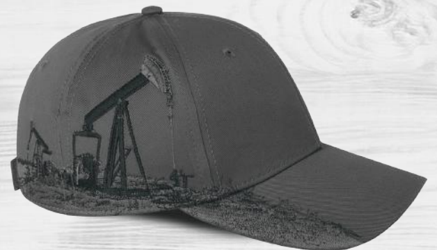
3330 OIL FIELD Grey / $24.99